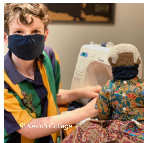
St Kevin's College