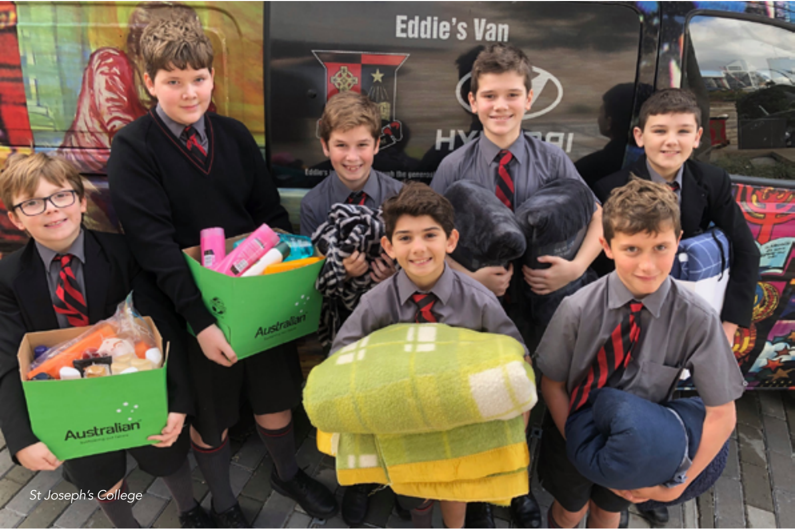
St Joseph's College