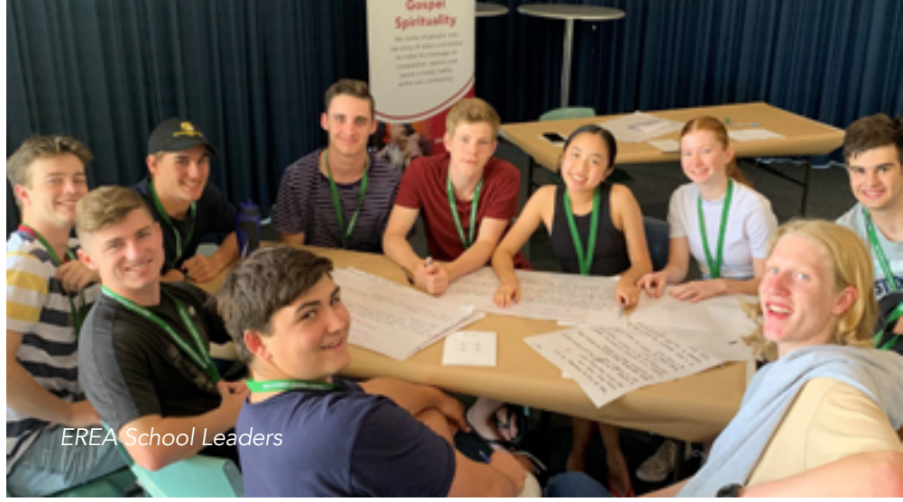
EREA School Leaders